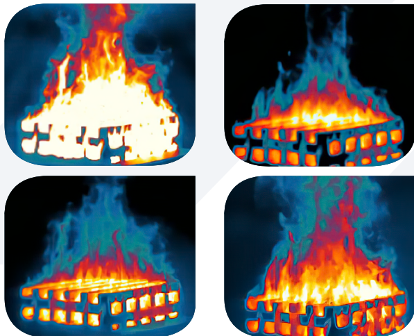
Multispectral image of burning wood crib