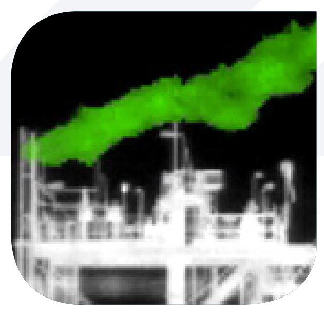
Industrial gas detection & identification